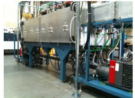
CIGSolar® Co-Evaporation System

The US National Renewable Energy Laboratories (NREL) certified peak conversion efficiency of 16.36% with an overall average of 15.91% for XsunX CIGSolar® samples. The key to delivering this potential is an innovative new approach that bridges the gap between inexpensive thin-film and high efficiency silicon wafer technologies to produce a new breed of solar cells combining the best attributes of each technology.